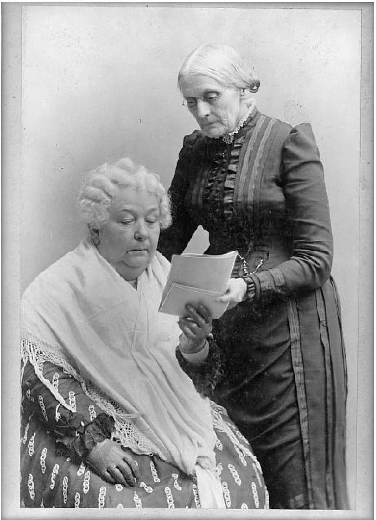
Elizabeth Cady Stanton and Susan B. Anthony.