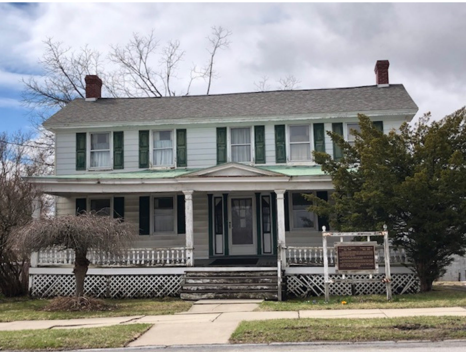
Mrs. Henry's Boarding House, 9 S. William St., Johnstown. Image taken March 31, 2020.