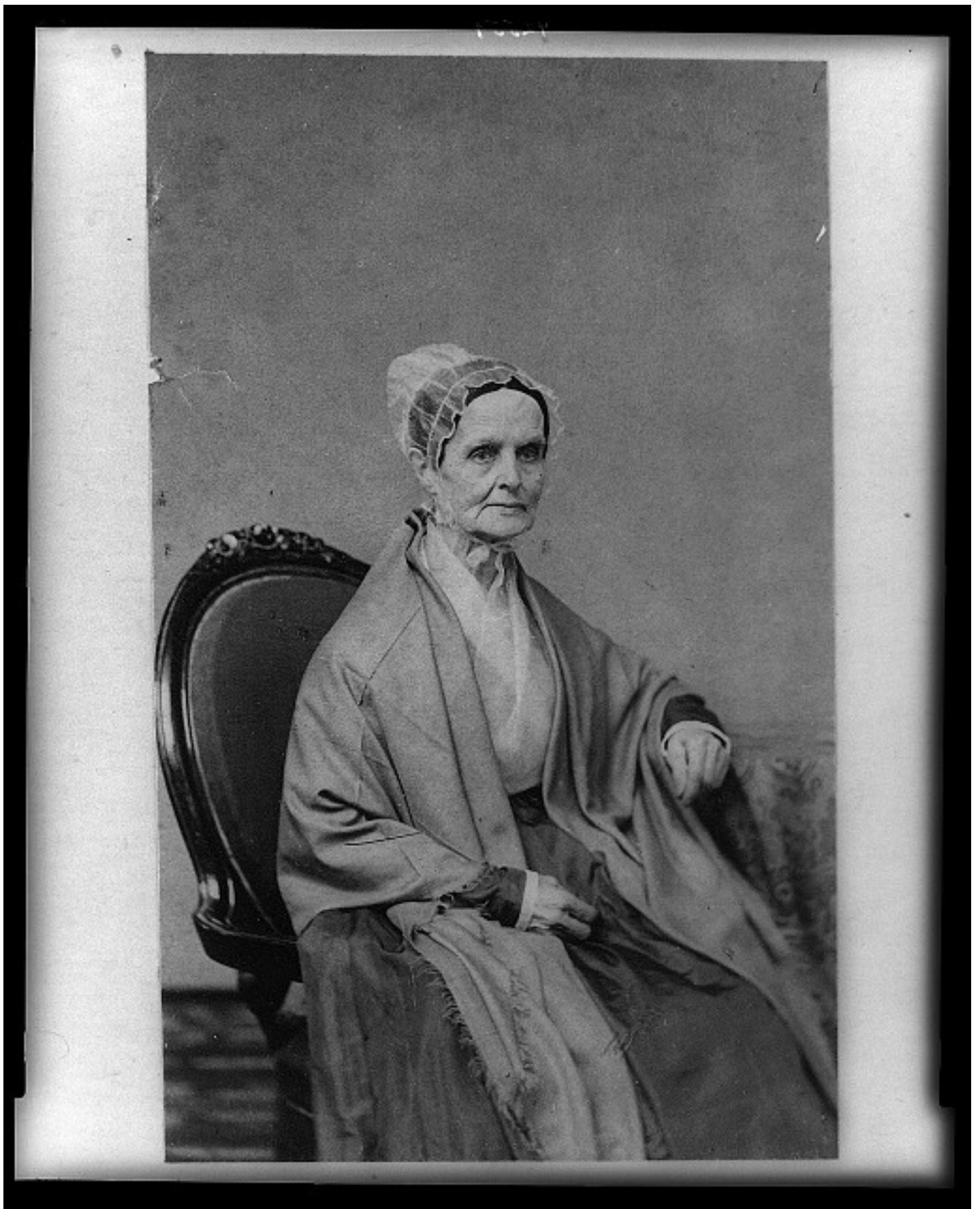
Lucretia Mott.