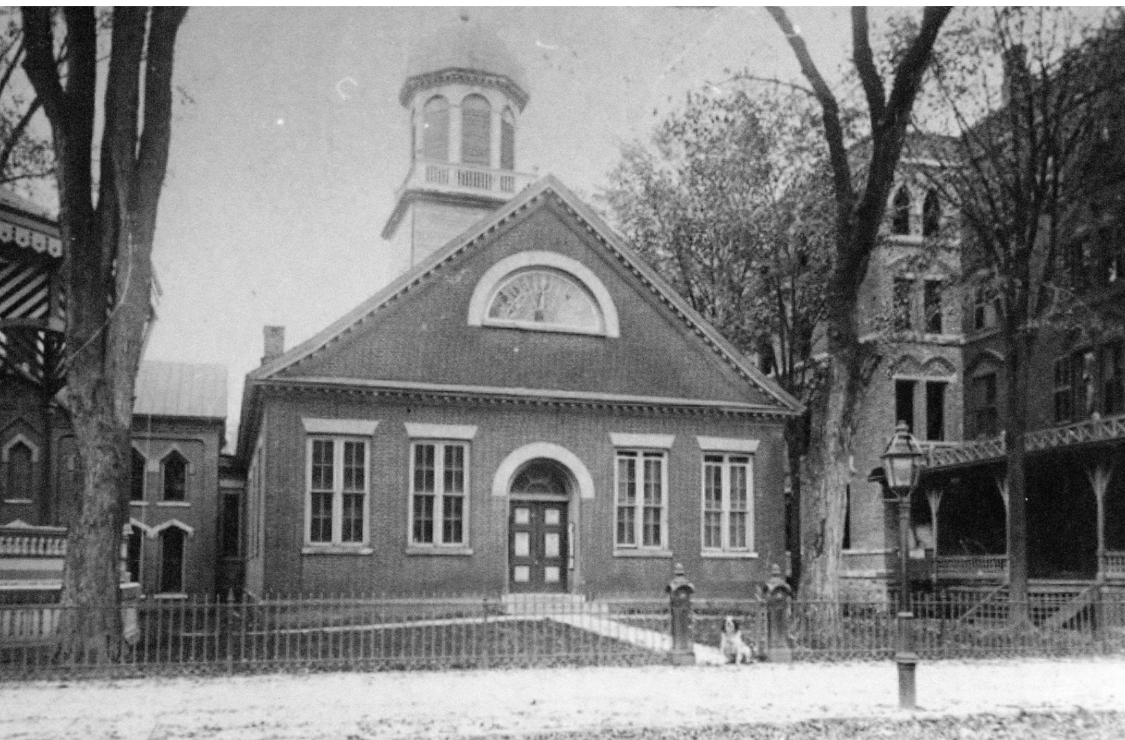
The Fulton County Court House in 1890.